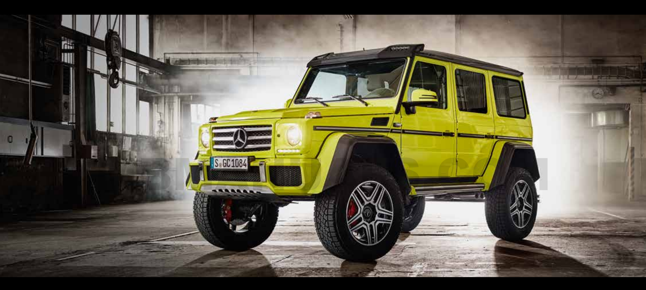
G~500~4x4^2 . The new model edition.