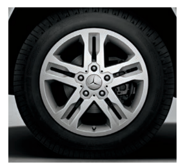
18" twin 5-spoke (G 550)