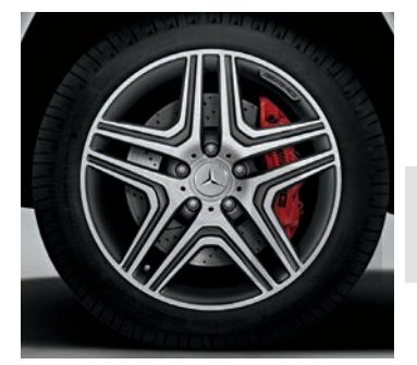
20" AMG twin 5-spoke (G 63 AMG)