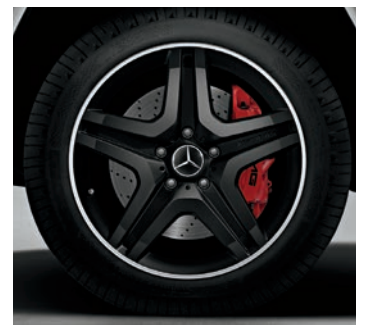
20" AMG 5-spoke, Black (optional at no charge on G 63 AMG)