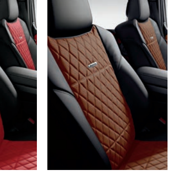
designo Light Brown/Black