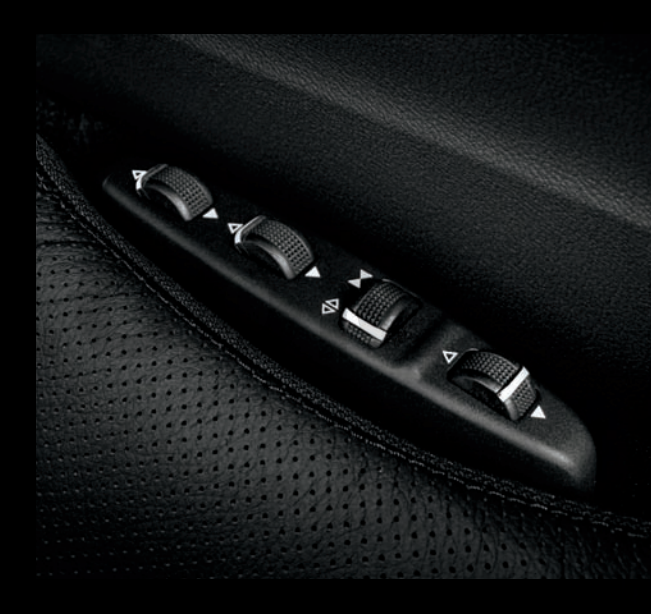
Rugged. Every G-Class is crafted almost entirely by hand in Graz, Austria. Its galvanized steel body is welded at over 6,000 points for strength. Its rigid frame is treated with 50 liters of wax to resist corrosion. From looming its wiring to outfitting its luxurious, roomy cabin, each vehicle it takes over 40 hours to build. But it creates a lifetime of durability.