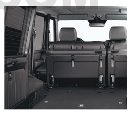
Here's one standard feature that actually gives you options. The second-row seats fold forward in a 60/40 split, so you can accommodate up to five passengers, or nearly 80 cu ft of cargo, or a variety of combinations in between.