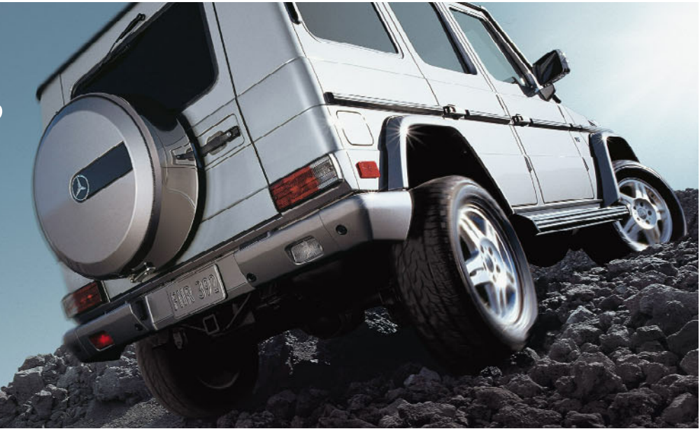
G 500 shown in Brilliant Silver metallic with dealer-installed accessory trailer hitch.

In an age when so many SUVs just seem to talk the talk, the Mercedes-Benz G-Class actually walks the walk—over almost any terrain. Permanent 4-wheel drive teams with our 4-wheel Electronic Traction System (4-ETS) to take you places ordinary SUVs only go in their dreams. With three mechanical differential locks and the ability to climb or descend an 80% incline,<sup>1</sup> the G-Class gives you off-road options many SUVs can only imagine. Step above the fray and take the shortcut on the way home. Not to save time, but just because you can. In fact, "you can" is a concept you'll get used to behind the wheel of the G-Class.