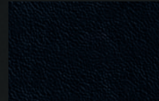
designo Black (G 55 AMG only)