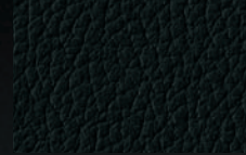
Black (G 550 only)