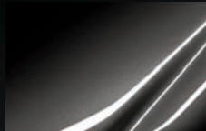
designo Graphite (G 55 AMG only)