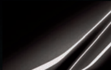
designo Mocha Black (G 55 AMG only)