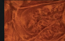
designo Natural Maple (G 55 AMG only)