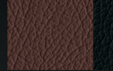
Chestnut/Black (G 550 only)