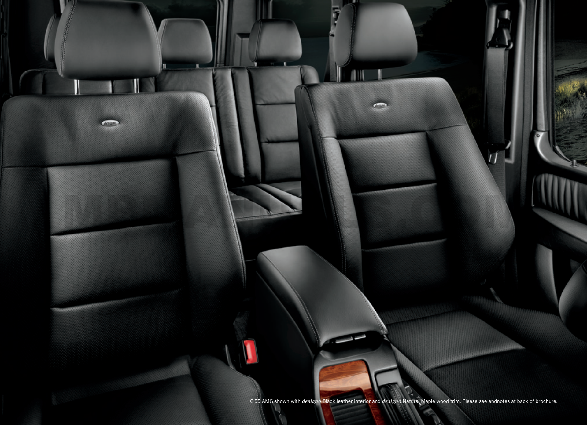
G55 AMG shown with designo Black leather interior and designo Natural Maple wood trim. Please see endnotes at back of brochure.