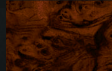
Burl Walnut (G 550 only)