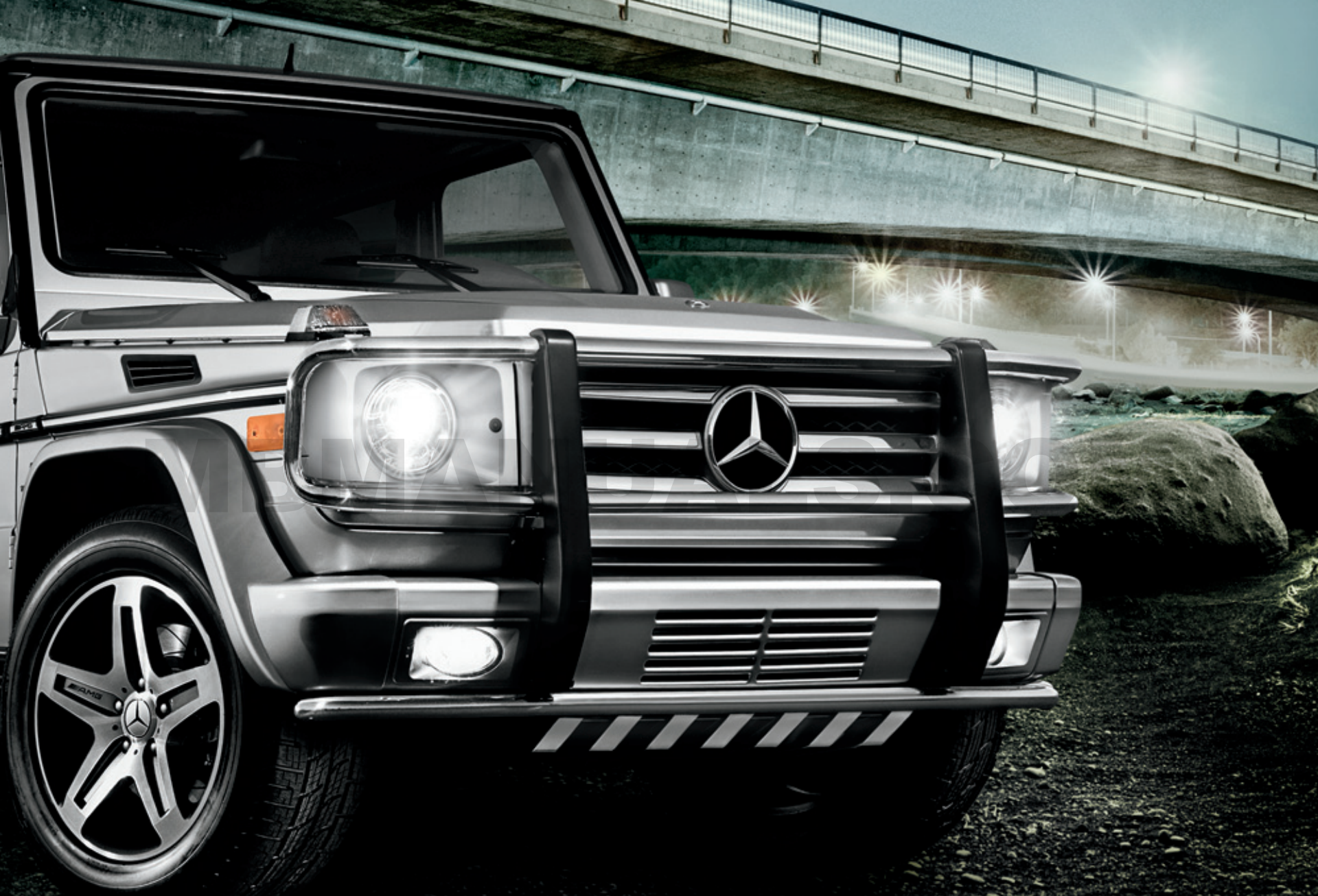
G 55 AMG shown with designo Graphite metallic paint. Please see endnotes at back of brochure.