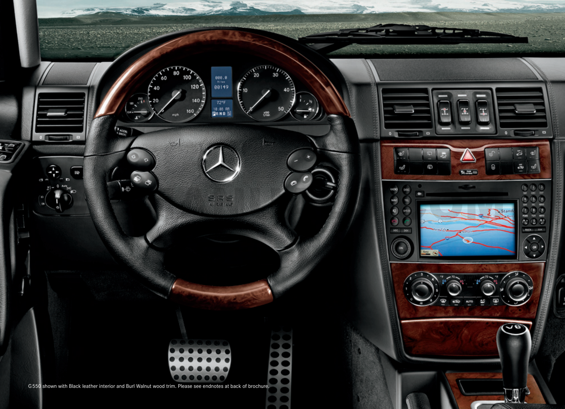
G550 shown with Black leather interior and Burl Walnut wood trim. Please see endnotes at back of brochure.