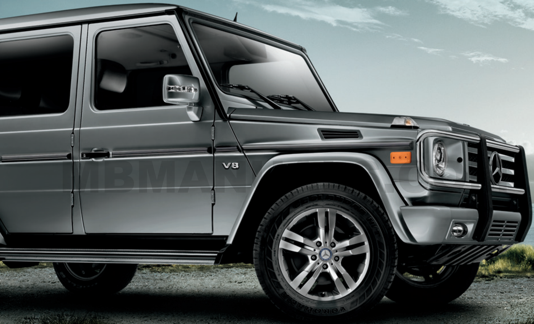
G550 shown on front cover with Iridium Silver metallic paint. G55 AMG shown on back cover with Flint Grey metallic paint. G550 shown above with Flint Grey metallic paint.