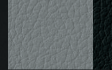
Ash/Black (G 550 only)