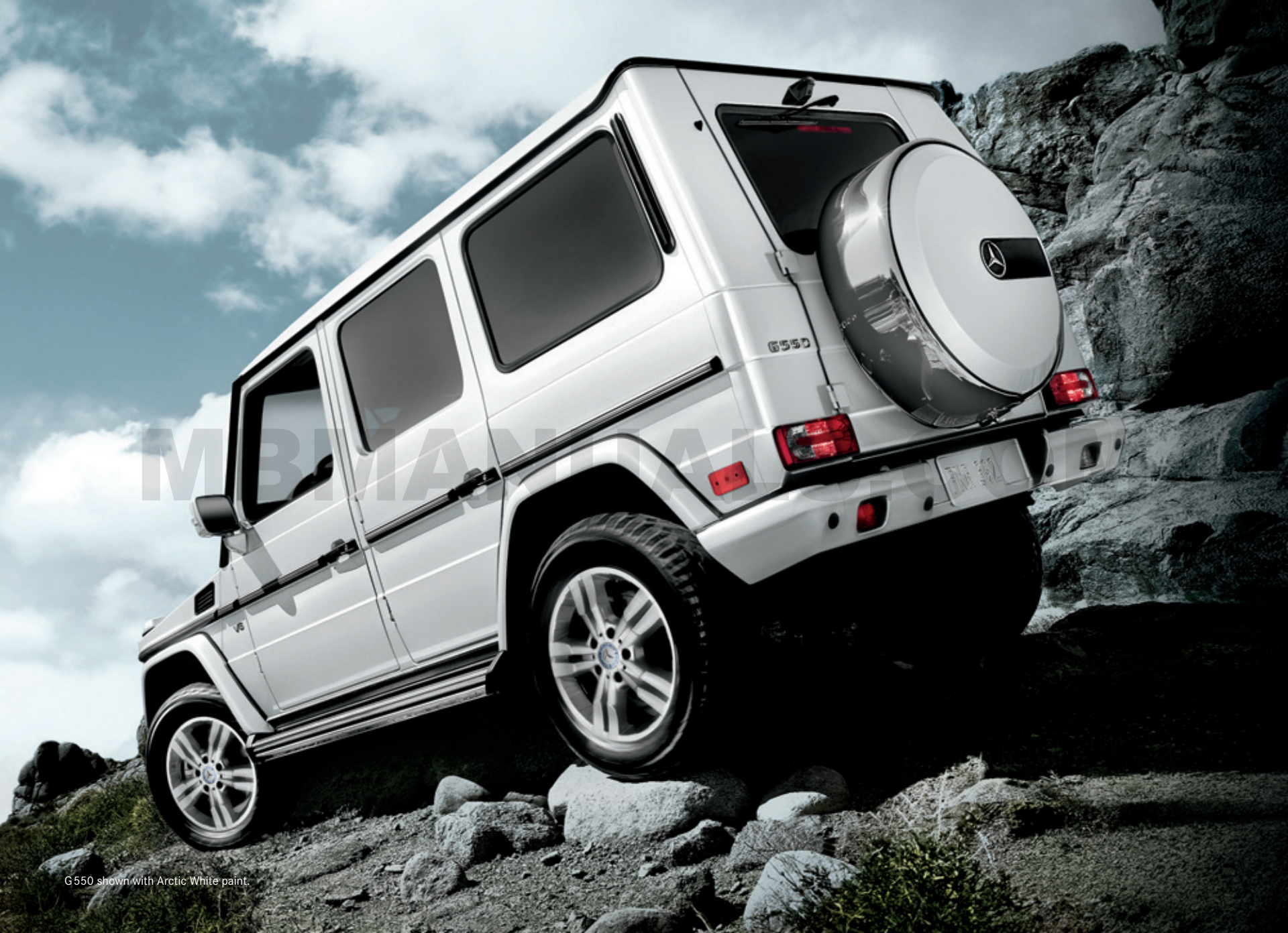
G 550 shown with Arctic White paint.