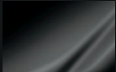
Matte designo Magno Night Black 16 (G 55 AMG only)